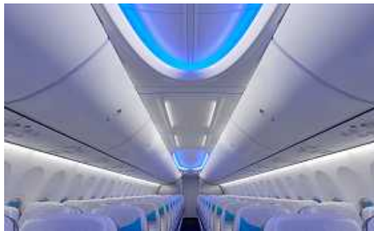
737 Boeing Sky Interior